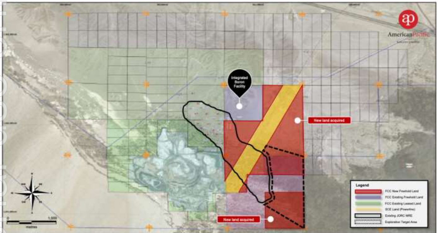
Figure 3: Fort Cady Boron Project map showing land ownership

In parallel with the preparation of the Exploration Target and drill hole targets, the Company has been progressing the acquisition of land in the South Eastern section of the deposit. To this end, the Company is pleased to report it has recently acquired three parcels of land and associated mineral rights. The land parcels are identified below.