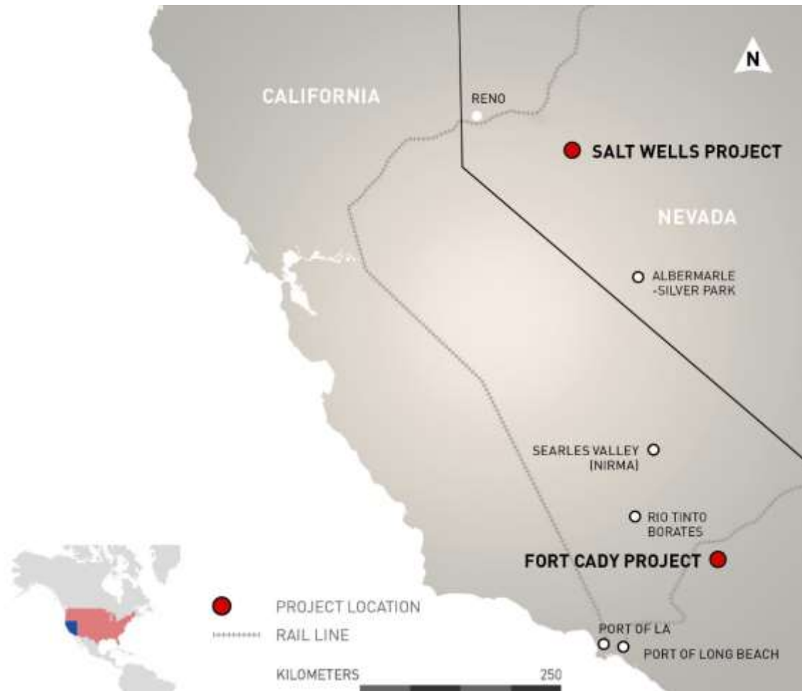
Figure 4: Location of the Fort Cady and Salt Wells Projects in the USA